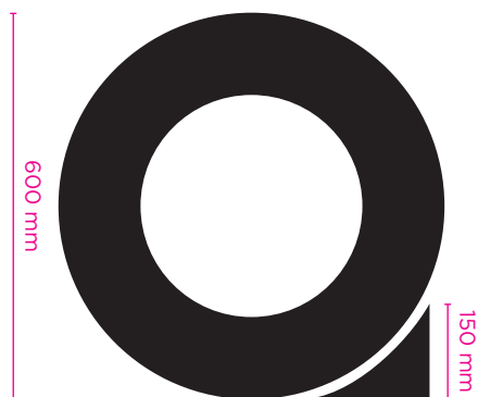
FIGURE 1: Wheel chock

A wheel chock should be approximately 25% of the diameter of your vehicle tyre and fit snugly into the tyre (eg a 600 mm diameter tyre would require a 150 mm high wheel chock).