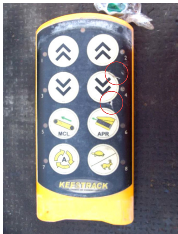
FIGURE 1: Remote control showing tears in the overlay

The supplier and servicing agent were contacted and an assessment of the machine was carried out.