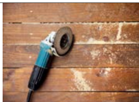
Wood dust from using an electric grinder